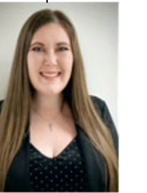
Fiscal Tech Ry Siderius